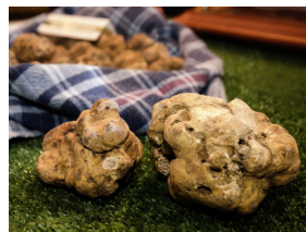
TARTUFO DI ACQUALAGNA

The Valli del Metauro and del Cesano connect with the city of Fano as a single, vibrant and multifaceted destination, one that generates unique experiences for visitors.