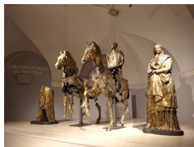
BRONZI DORATI DI PERGOLA