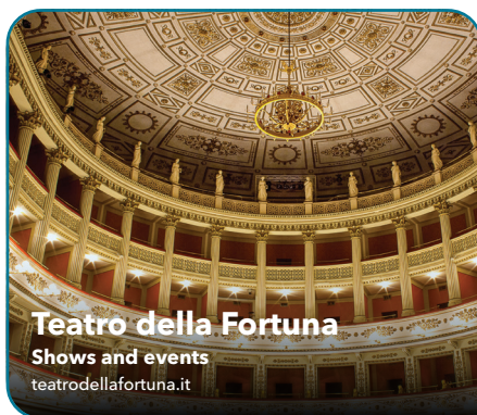
Teatro della Fortuna Shows and events teatrodellafortuna.it