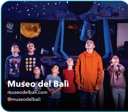
Museo del Bali museodelbali.com @museodelbali