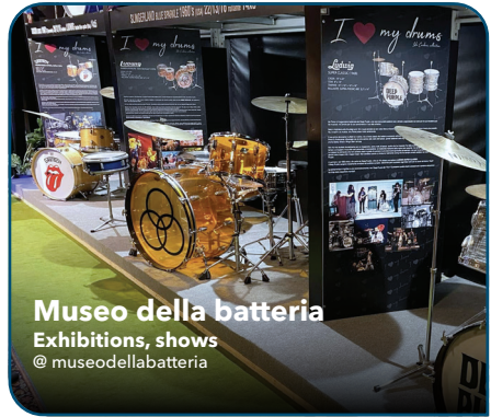
Museo della batteria Exhibitions, shows @museodellabatteria