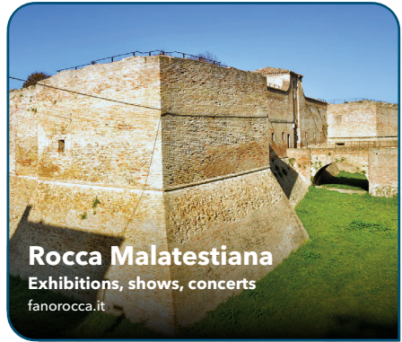
Rocca Malatestiana Exhibitions, shows, concerts fanorrocca.it