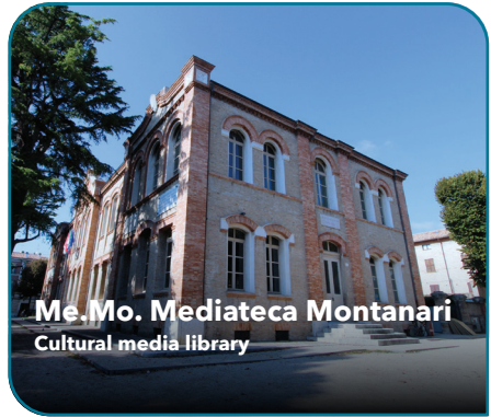
Me.Mo. Mediateca Montanari Cultural media library