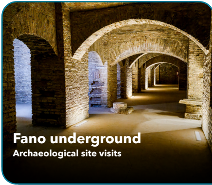
Fano underground Archaeological site visits