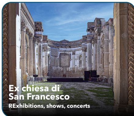
Ex chiesa di San Francesco RExhibitions, shows, concerts