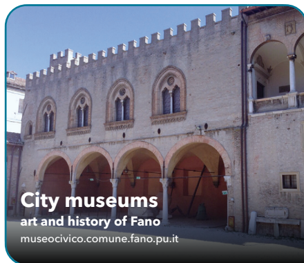
City museums art and history of Fano museocivico.comune.fano.pu.it