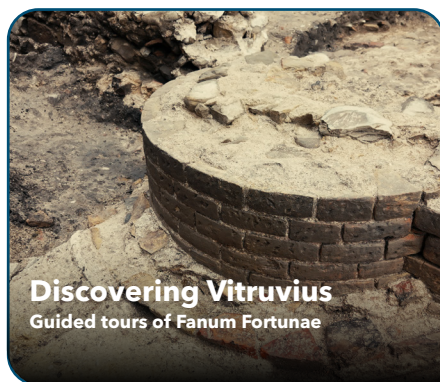
Discovering Vitruvius Guided tours of Fanum Fortunae